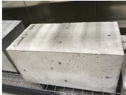
Figure 3. Non-reactive aggregate reinforced concrete sample (control sample).