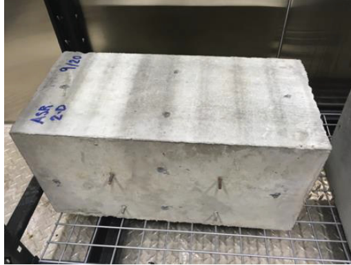
Figure 4. Reactive aggregate reinforced concrete sample with bidirectional confinement.

Subtask 3 will be performed by Vanderbilt University personnel, under the direction of Prof. Sankaran Mahadevan. VAM tests will be conducted on the four samples at regular intervals to detect, diagnose and monitor the ASR-related damage. The tests will consist of excitation at two frequencies (high and low) and measurement of the dynamic response at multiple locations using accelerometers. During the curing period, Vanderbilt personnel will travel to UNL to conduct VAM tests. After the four slabs are shipped to Vanderbilt, VAM tests will be continued to monitor the damage progression.