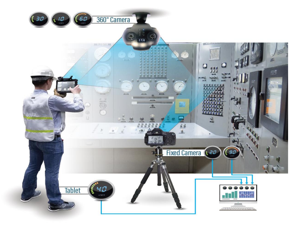
Figure 1. Automated gauge reading enables any camera to be used to log several gauges autonomously.

NRC approval, an LAR must be submitted<sup>d</sup>. Because AGRS is based on digital technology/software, the LAR must meet DI&C-ISG-06 [6] guidance for licensing DI&C systems. Section 2 discusses example requirements that would have to be addressed for an NPP-specific AGRS LAR submission.