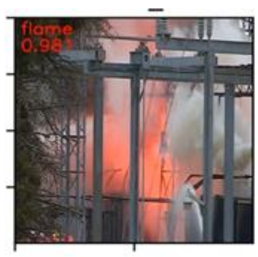
Figure 2. Automating fire detection via a video stream enables a camera and CVML system to perform fire watch.

The LWRS program created a CVML technology that can migrate fire watch from a manual (human) model to an automated one. It involves replacing human-based fire watch with a video camera and CVML-based fire/smoke detection model and algorithm (Figure 2). Initial implementation of the CVML system for fire watch could take the form of a mobile system (e.g., a crash cart or suitcase device) that can be relatively easily deployed in the NPP environment to take the place of fire watches conducted by human operators.