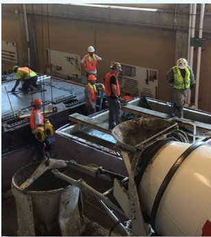
Construction of the large concrete test blocks to evaluate alkali-silica reaction effects on concrete.