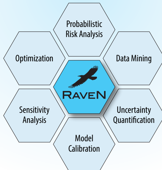
Figure 1. RAVEN capabilities.

In addition to the significant code enhancements, the documentation and training material has also been updated. The open source RAVEN 2.0 can be downloaded from: https://github.com/idaholab/raven/releases/tag/RAVENv2.0 . https://raven.inl.gov : Version 2.0.