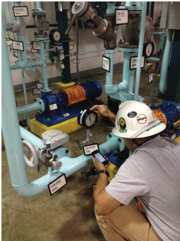
Figure 3. An Auxiliary Operator uses the CBP system as a part of the November 2013 Evaluation Study.

The third study also was the first of the ones conducted where there was no significant time difference between conducting the task with the paper-based procedures or CBPs. The researchers identified three main reasons for the potential time difference between using paper-based procedures and CBPs in the studies. First, the design concepts used in the CBP needed to be refined based on the input from the participants to adequately provide performance benefits. Secondly, the participants only received a brief training on the CBP system before they were asked to conduct the task using the CBP system. In the real world, the users would receive more extensive training. The reason for the brief training was to investigate how self-explanatory and user-friendly the design of the CBP system is. Lastly, even though the participants were instructed to save any comments about the CBP system until they had completed the task most of them were quite eager to share their impressions with the researchers while conducting the task. This phenomenon did not happen when they conducted the task with the traditional paper-based procedure. Figure 3 below depicts one of the participants in the evaluation study conducted in a flow loop facility in November 2013.