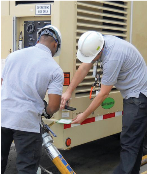
Figure 4. Two Auxiliary Operators use the CBP System during the April 2014 Field Evaluation Study.

In order for CBP system to provide the highest value to the nuclear industry, it needs to encompass more than just procedures for auxiliary operators. The CBP system needs to be able to handle all types of instructions, checklists, procedures, work orders and other documents used in the plant. The vision is to have all the different organizations within the plant use the same system. To achieve the goal of one system the researchers have to make sure the system will be able to handle a broad variety of tasks and situations; therefore, collaborating with multiple utilities and multiple organizations within the utility (e.g., Operations, Maintenance, and Chemistry) is essential. Hence, a series of field tests will be conducted at multiple utilities to ensure that the result from the current research effort is applicable both within individual plants and across the fleet of utilities.