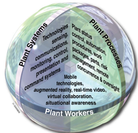
Figure 1. Seamless information architecture