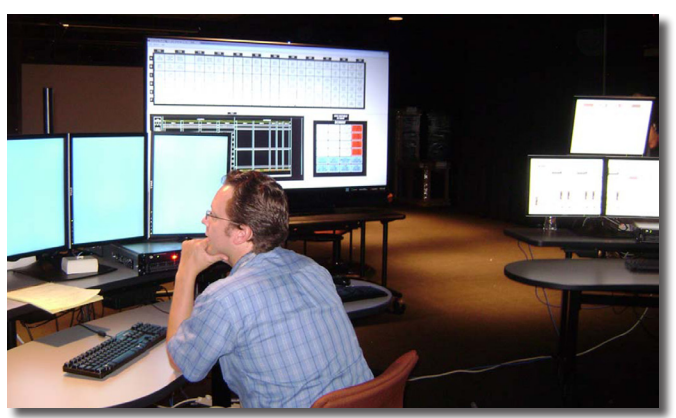
INL has developed a reconfigurable simulation laboratory capable of testing human performance in multiple nuclear power plant (NPP) control room simulations.